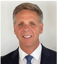
ADM. Philip S. Davidson