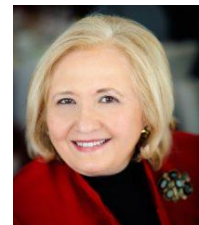
Amb. Melanne Vermeer